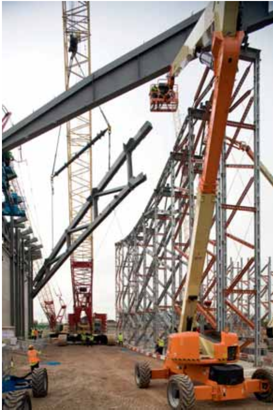
The Aquatics Centre - Progress - Roof steel lifted into place March 2009