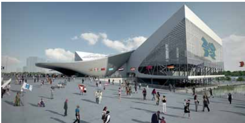
Design of the Aquatics Centre, Photo courtesy of London 2012

During the Games the Centre will comprise a 50m competition pool, a 50m training pool and a diving pool. It will have capacity for 17,500.