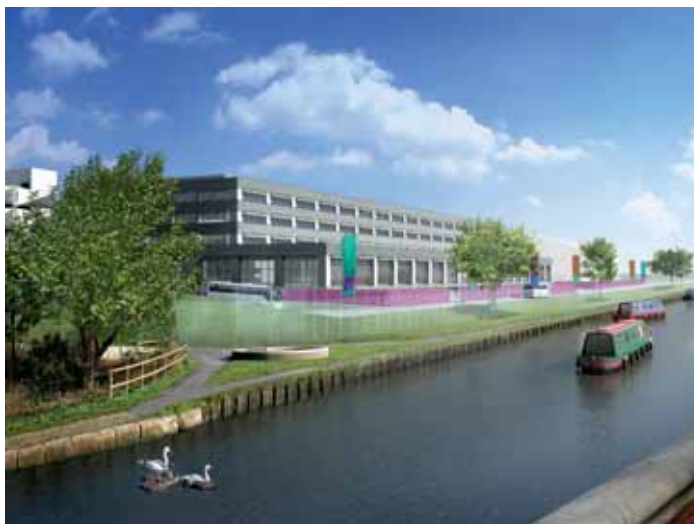
Design of the Main Press Centre

It is planned to be a permanent structure with some temporary elements and will be located in the north west corner of the Olympic Park. Demanding 'green' standards have been set for the MPC such as the use of recycled non-drinking water and the introduction of new habitats to attract wildlife.