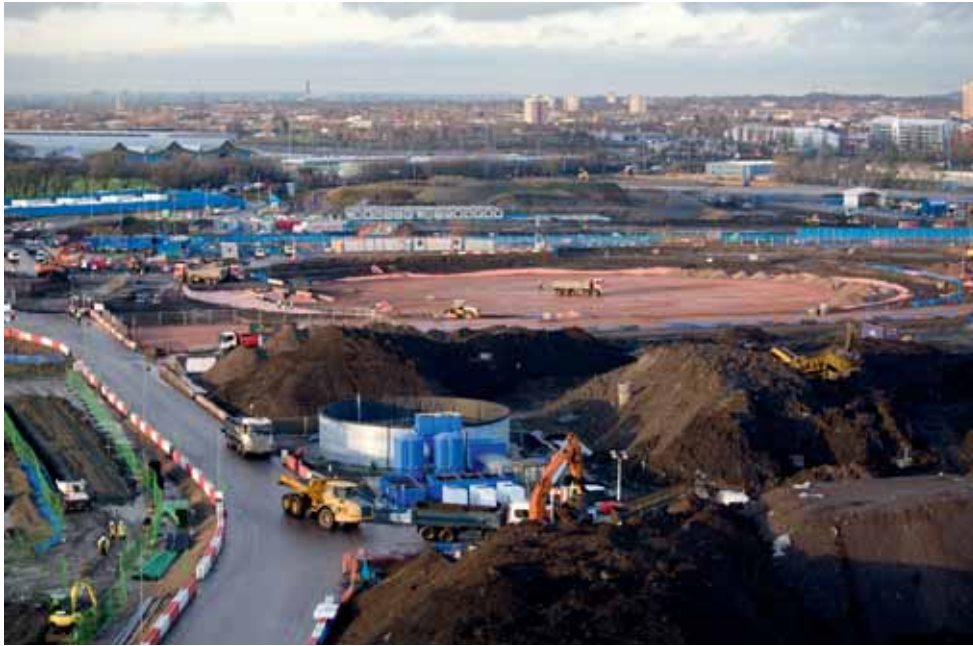
Velopark Progress, December 2008