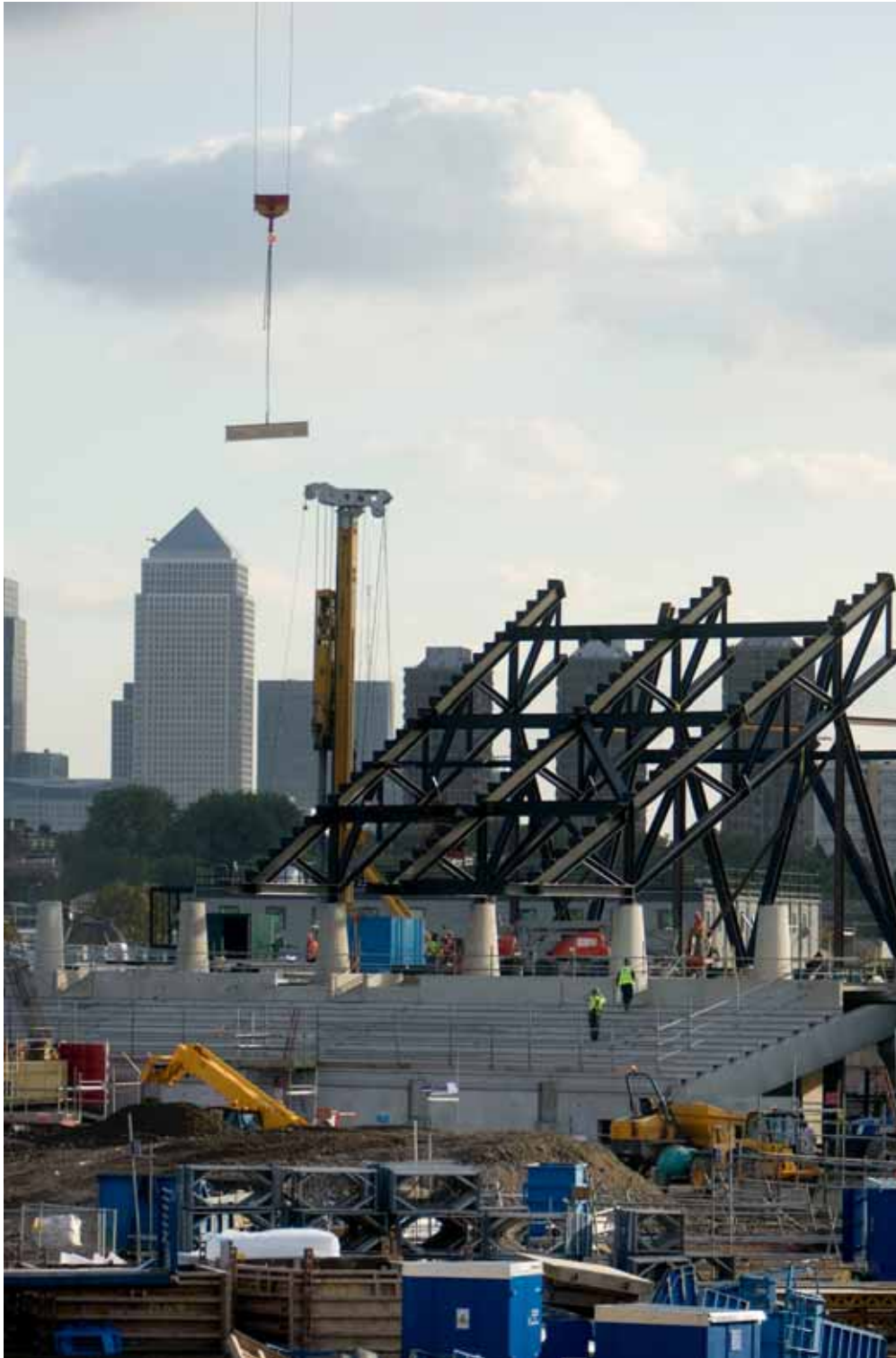
Olympic Stadium - October 2008