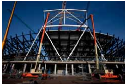
The Olympic Stadium - images and progress